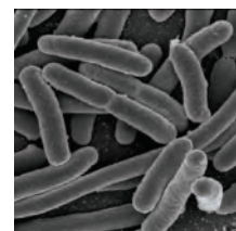
Escherichia coli (E. coli)